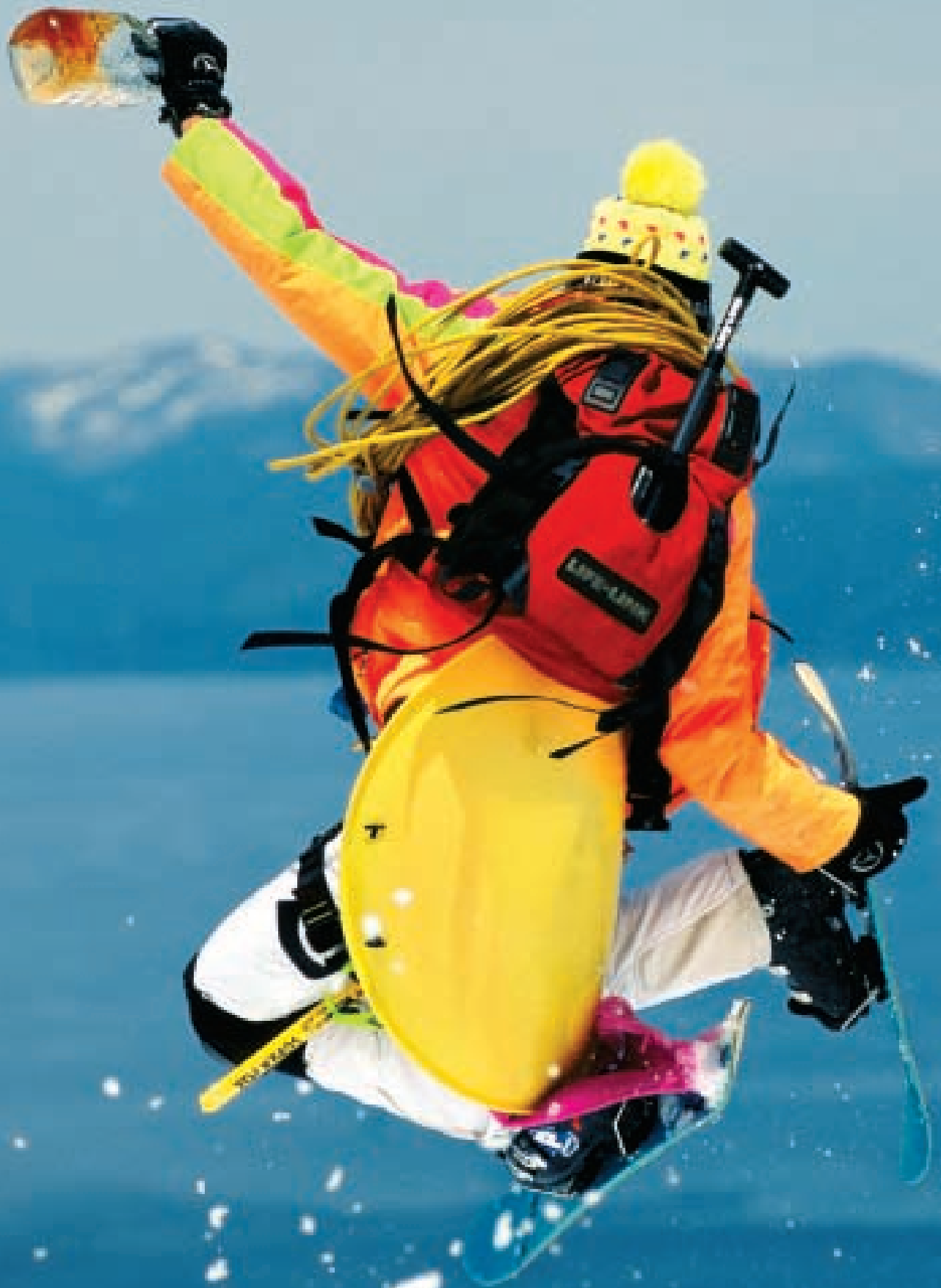
Nailing the grab but missing the Beam, Saucer Boy prepares to stick uphill ice.